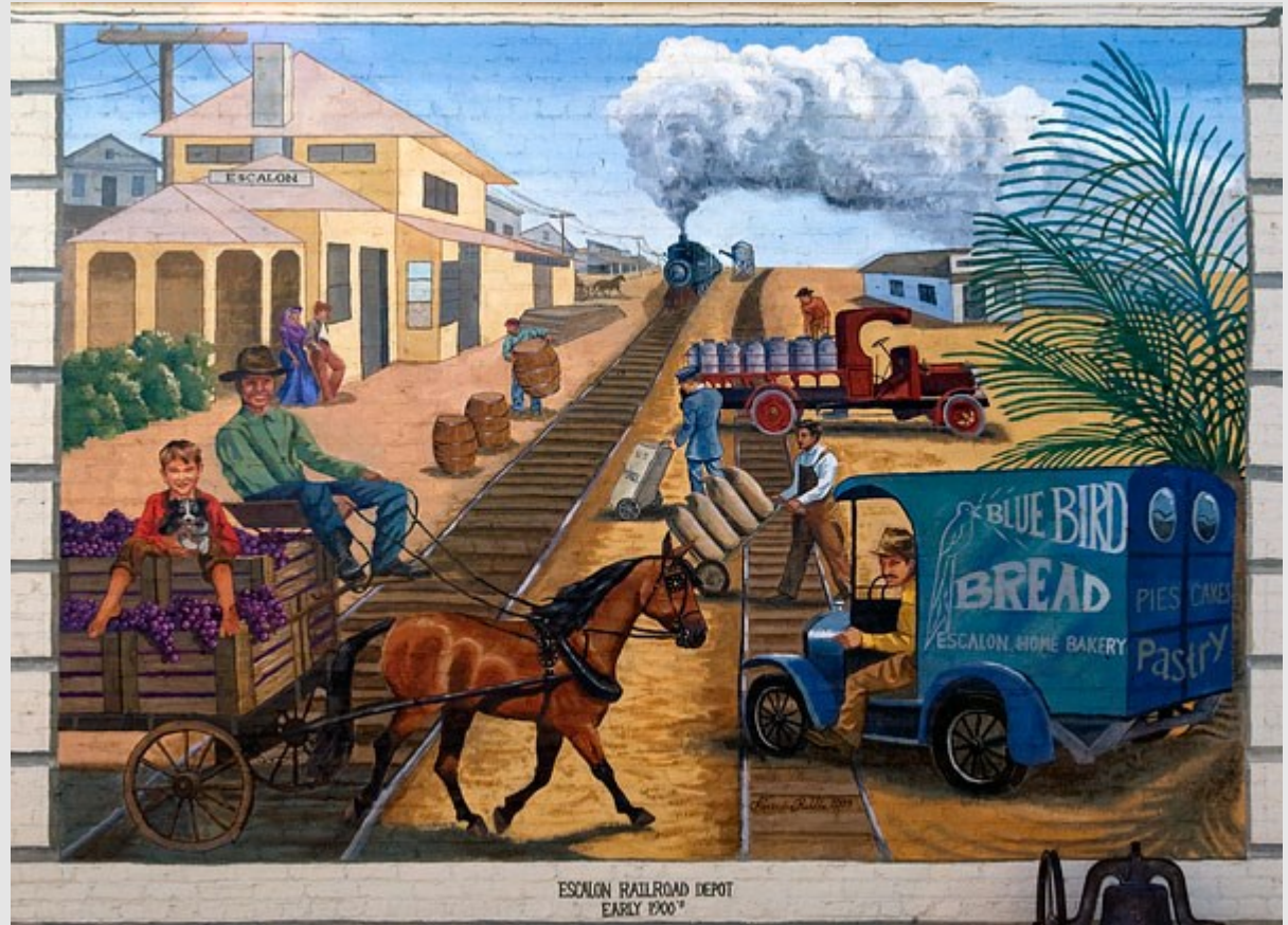
ESCALON RAILROAD DEPOT EARLY 1900'S

Former Bradbury Real Estate and the T.W. Thomas Insurance offices