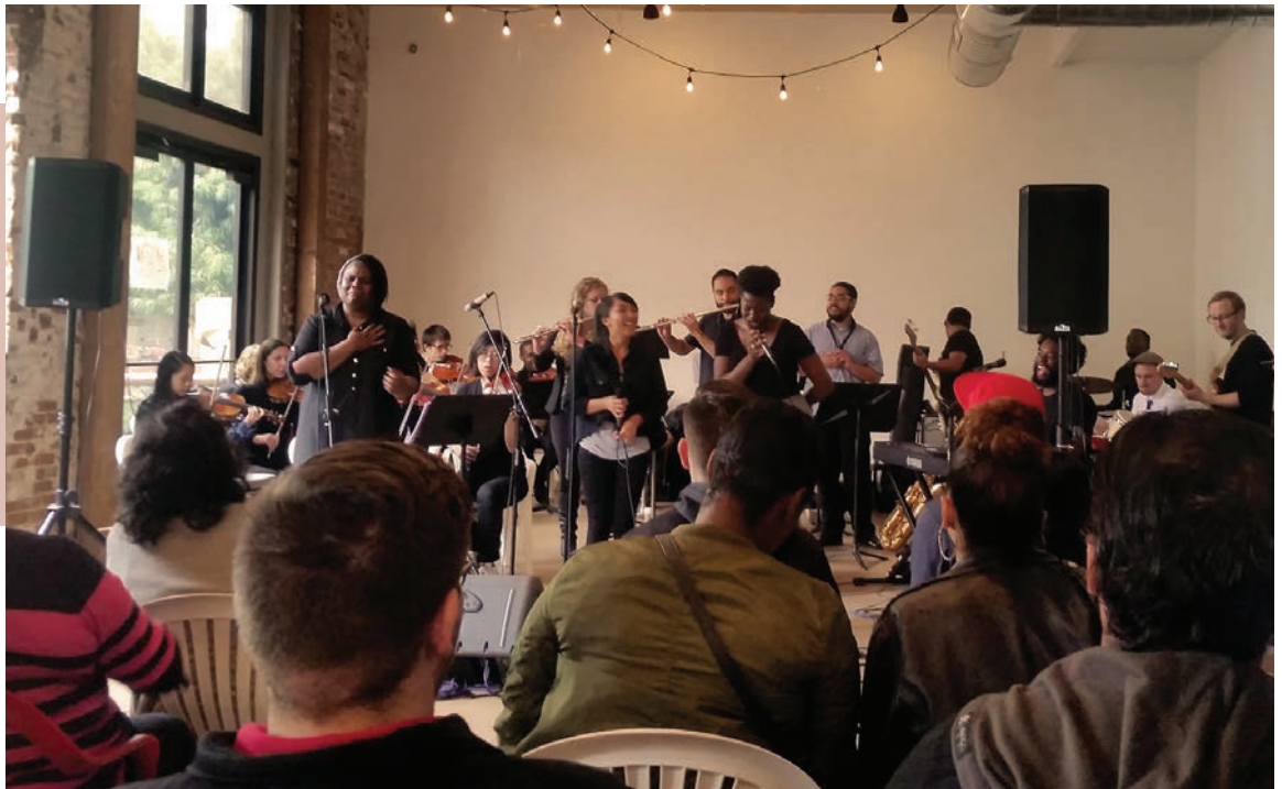
Brick & Mortar Venue was filled in 2016 with many community, arts, and business events. Pictured is CP Universe Concert which kicked off Stockton Arts Week in Downtown.