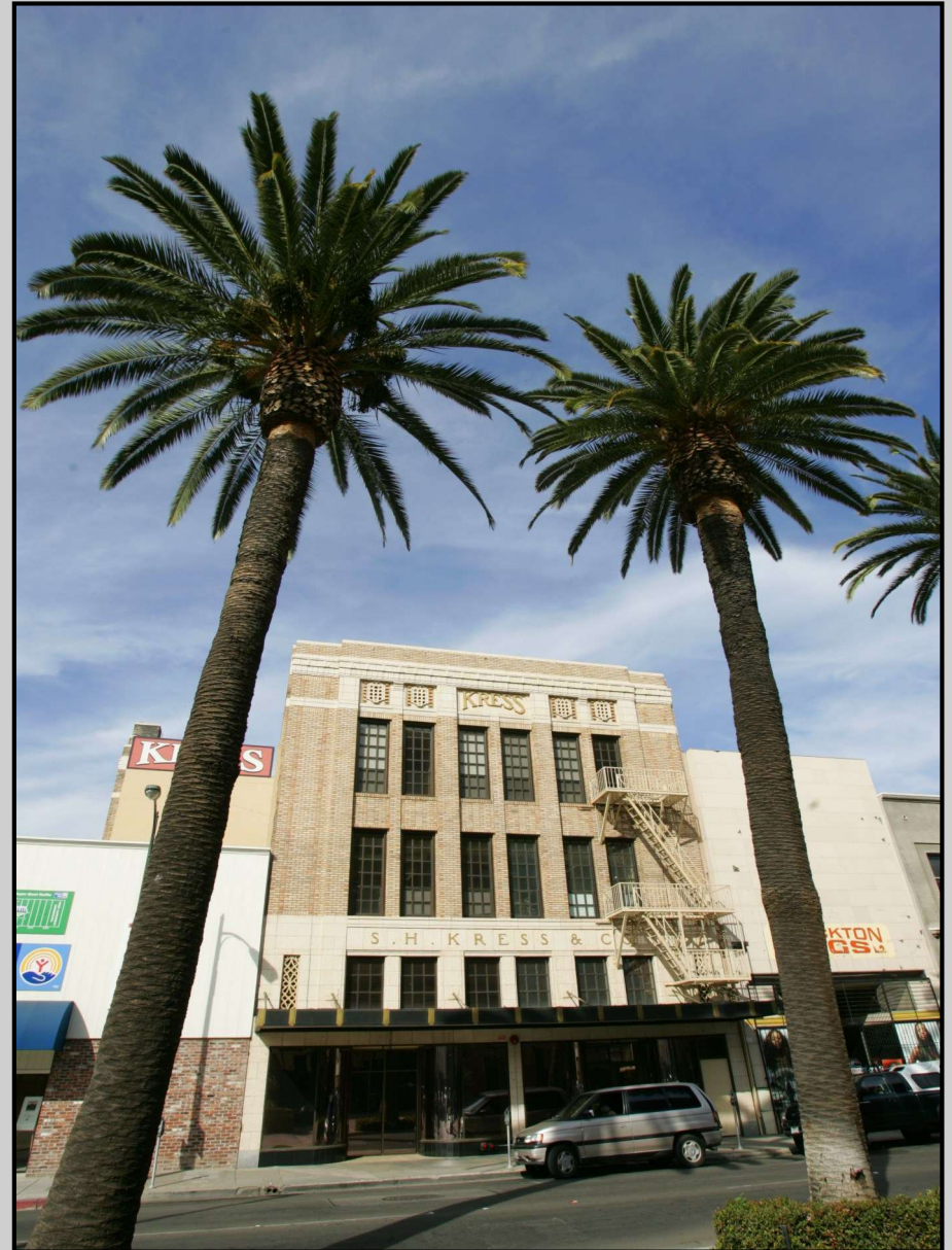
Main Street entrance