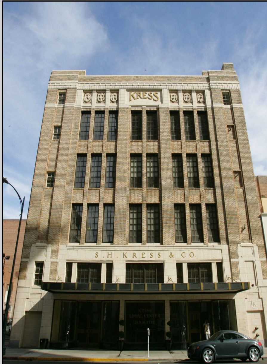
Sutter Street entrance