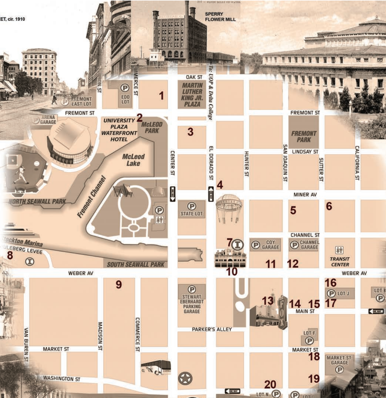
FARMERS MARKET ON WEBER AVENUE, cir. 1905