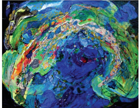
Welcome to My Heart