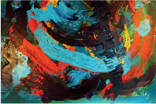
Sweet Blue #2